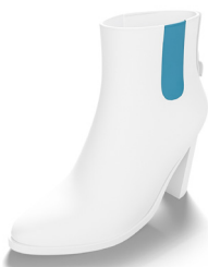
Fine Thin Elastic Article 26040