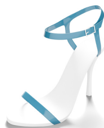
Special Strap Elastic Article 28110