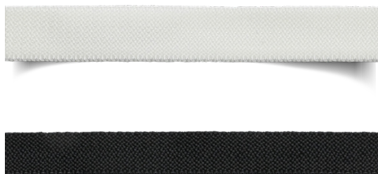
Elasticised Strapping Article 6015

Standard colours available - White 50 - Black 99