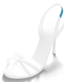
Elasticised Strapping Article 6015