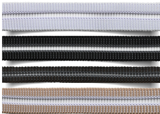
Buckle Elastic Article 800

Standard colours available - White 50 - Black 99 - Dark Brown 1265 - Beige 5142