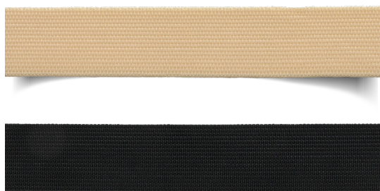
Elastic Dorlastan Binding Article 5050

Standard colours available from an extensive range. Special colours on request.