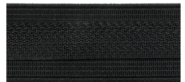
Centre Coated Lasting Tape Article 49113, 8 + 10 mm