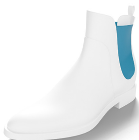
Durable Strong Elastic Article 24102

Widths available (mm) 6 / 8 / 10 / 12 / 15 20 / 25 / 30 / 40 / 50 60 / 80 / 100