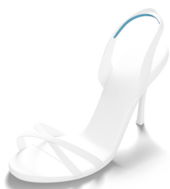
Anti Slip Elastic Article 23033