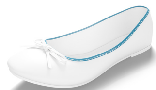
Elastic Binding Article 5050