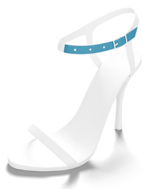
Buckle Elastic Article 800

Widths available (mm) 6 / 8 / 10 / 12 / 14 / 16